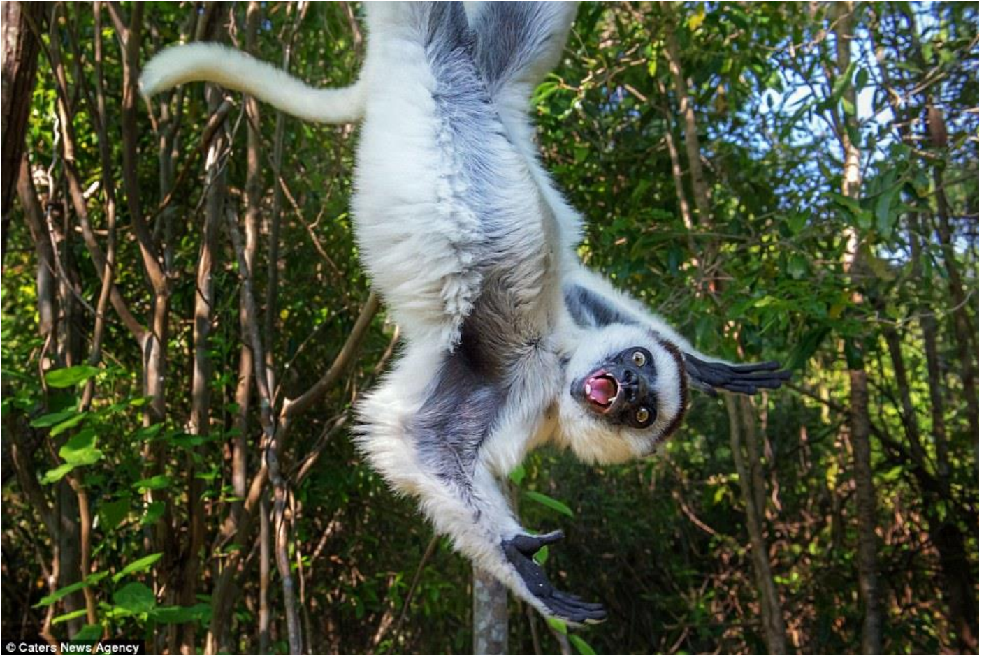
The monkey, a Verreaux's sifaka, swung down into the camera shot in this hilarious and perfectly-timed photobomb

'It was just such strange behaviour that I found hilarious. When the sifaka finally jumped away I had an incredible set of images that I won't forget.'